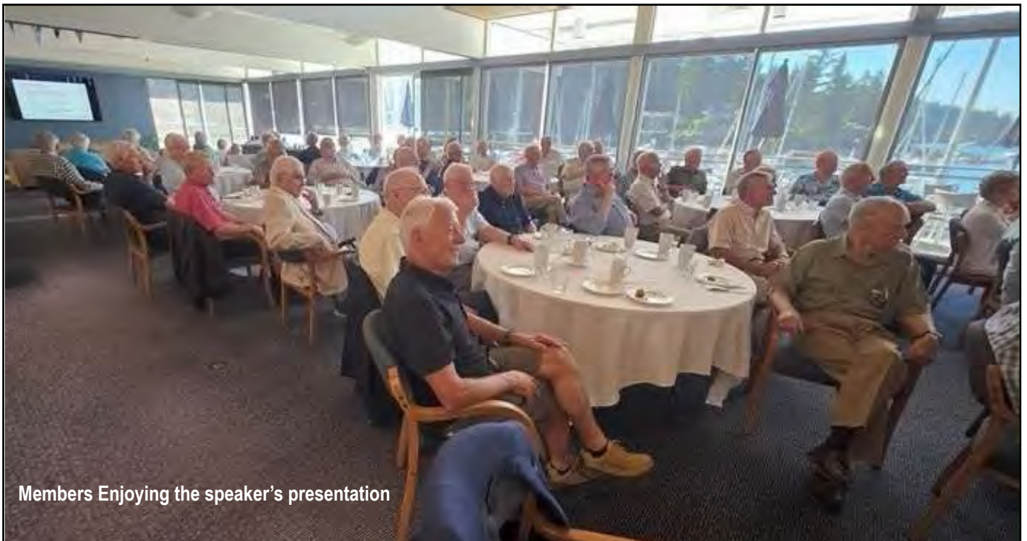
Members Enjoying the speaker's presentation