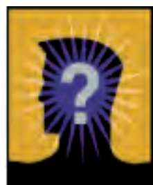
Vacant Chair: Membership