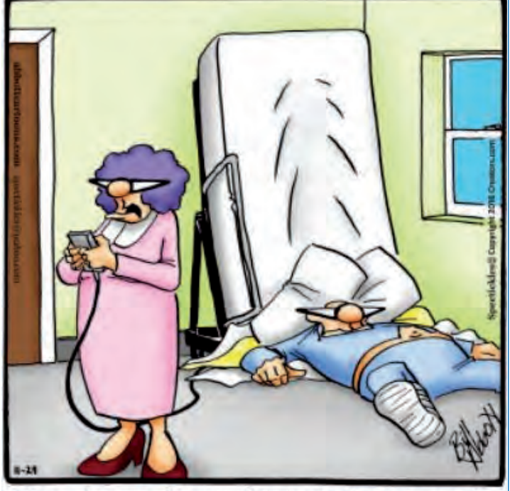
"How do you know this isn't the button for the nurses' station?"