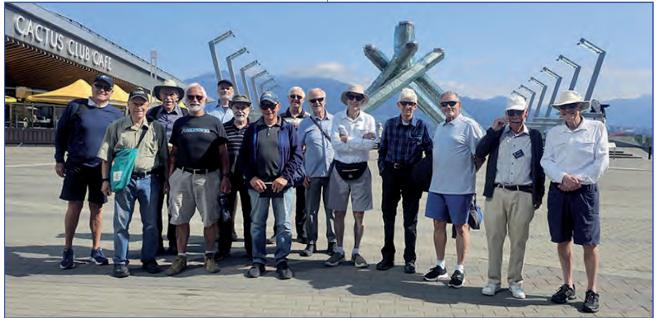
PROBUS North Shore Vancouver June Newsletter - Page 3