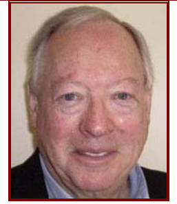
John Graham Seafood