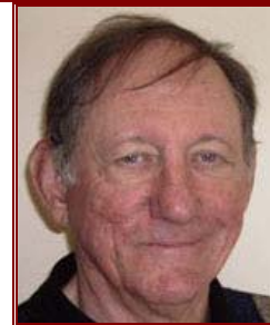
Gordon Thomson Engineering