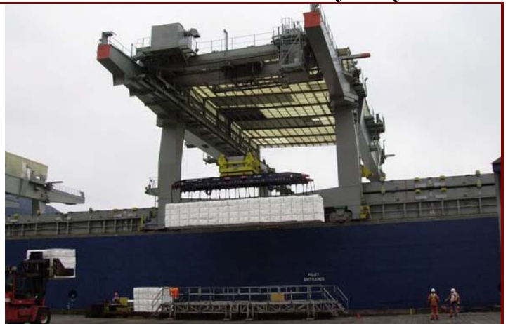
Large freighter loading pulp – takes three days

Twenty Members enjoyed a most interesting visit to the mill which is BC's longest surviving pulp and paper mill and one of the finest and most efficient newsprint and kraft producers in the world and highly acclaimed for its product excellence and ecological stewardship.