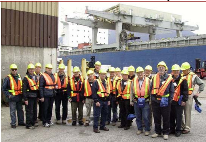
Members at Port Mellon Dock