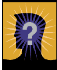
To Be Nominated Chair: Special Events