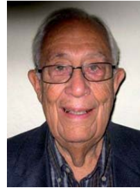
Alan Jones Industrial