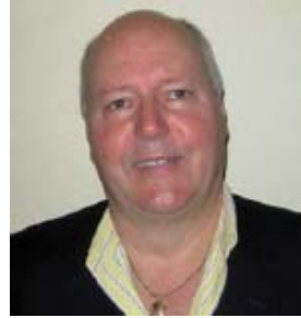
Rick Smyth Water Treatment